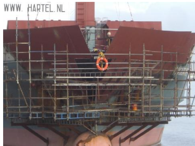
Erection of Fore Peak