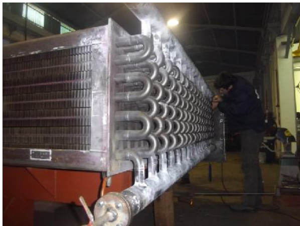
Inspection of welding