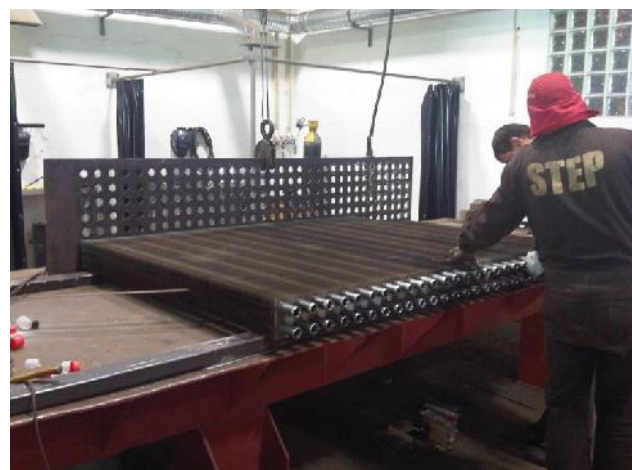
Alignment of Tubes