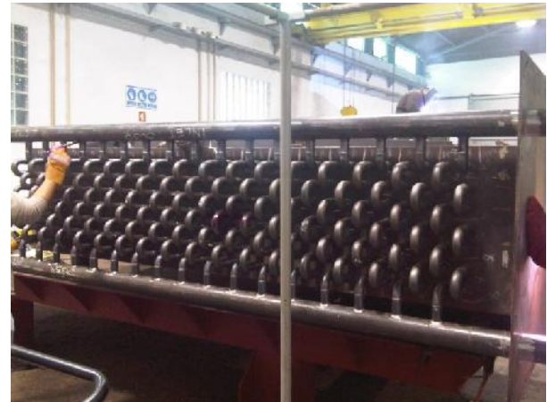
Liquid Penetrant on all welds