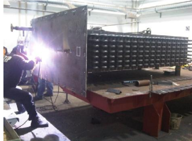
Welding on U-Bends and Top Cover