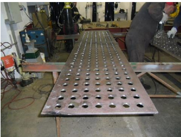
Preparation and drilling of Tube plate

STEP 2 - Challenge: Material list and as built Drawings according to Makers specification, with Class approval and inspection